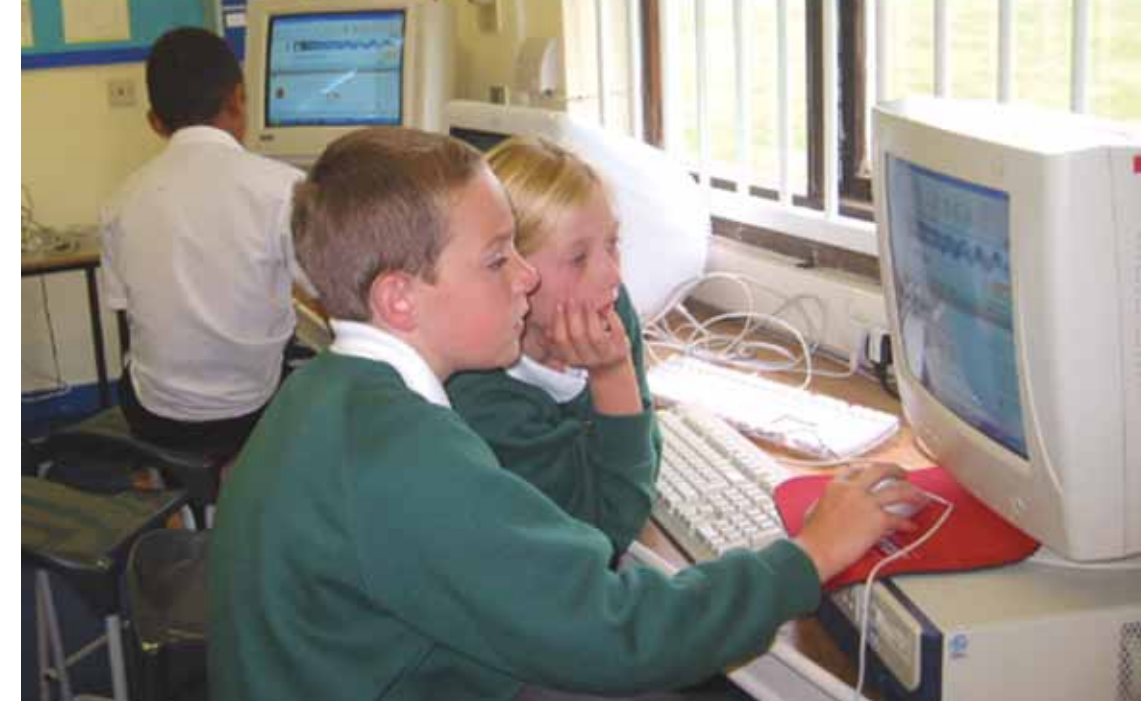
Pupils from Holne Chase Primary School, Milton Keynes, completing the evaluation quiz following their visit to the Safety Centre.

We would also like to thank Lloyds TSB for their generous donation which helps continue delivering all our safety messages to children.