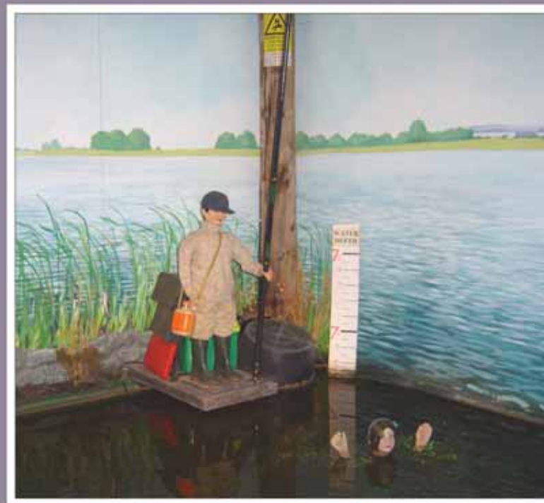
Water safety scenario sponsored by the Parks Trust.

"One such project, the Safety Centre at Milton Keynes, has become a model for fire and rescue authorities across the country."