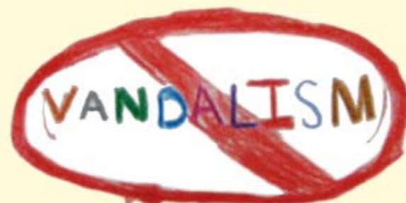
Below: This anti-vandalism sign was drawn by Ellie.

To help staff at Hazard Alley maintain the highest possible standards, teachers are asked to fill in evaluation forms after bringing children to the Centre. A selection of their comments will be featured in the next edition of Newsflash.